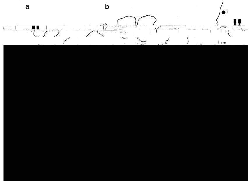
Fig. 1 (a) Area of North Island, New Zealand covered by pyroclastic flow (dark shading) and ash (pale stippling) following the most recent Taupo volcanic eruption (about 1850 years ago). (b) Collecting locations of Hemideina thoracica from the shore of Lake Taupo. Diagrams of chromosome markers show the northern race, hybrid, and southern race, from top to bottom, respectively.

ago and the surrounding area has since been subject to sporadic volcanic activity (Healy, 1992). The most recent Taupo eruption occurred about 1850 years ago (estimates range from 1857 to 1813 years ago). This eruption deposited pyroclastic rock over 20 000 km 2 and covered 30 000 km 2 of New Zealand in ash (Fig. 1a) (Wilson & Walker, 1985; Healy, 1992). Thus we know with certainty that plant and animal populations within a radius of about 80 km of Lake Taupo have arrived within the last 1850 years (see also McDowall, 1996).